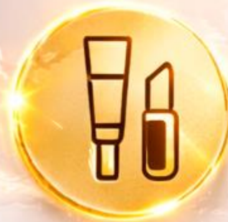
Cosmetic and equipment