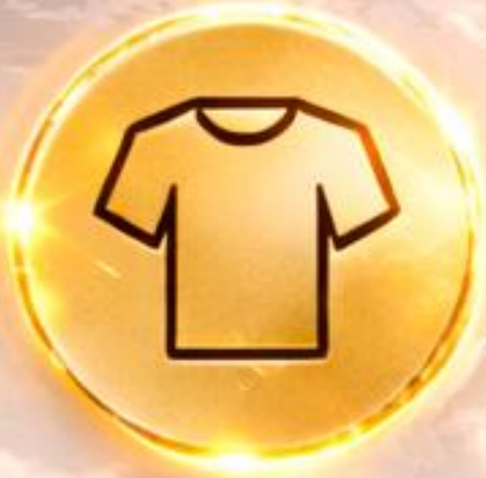
Clothes and shoes