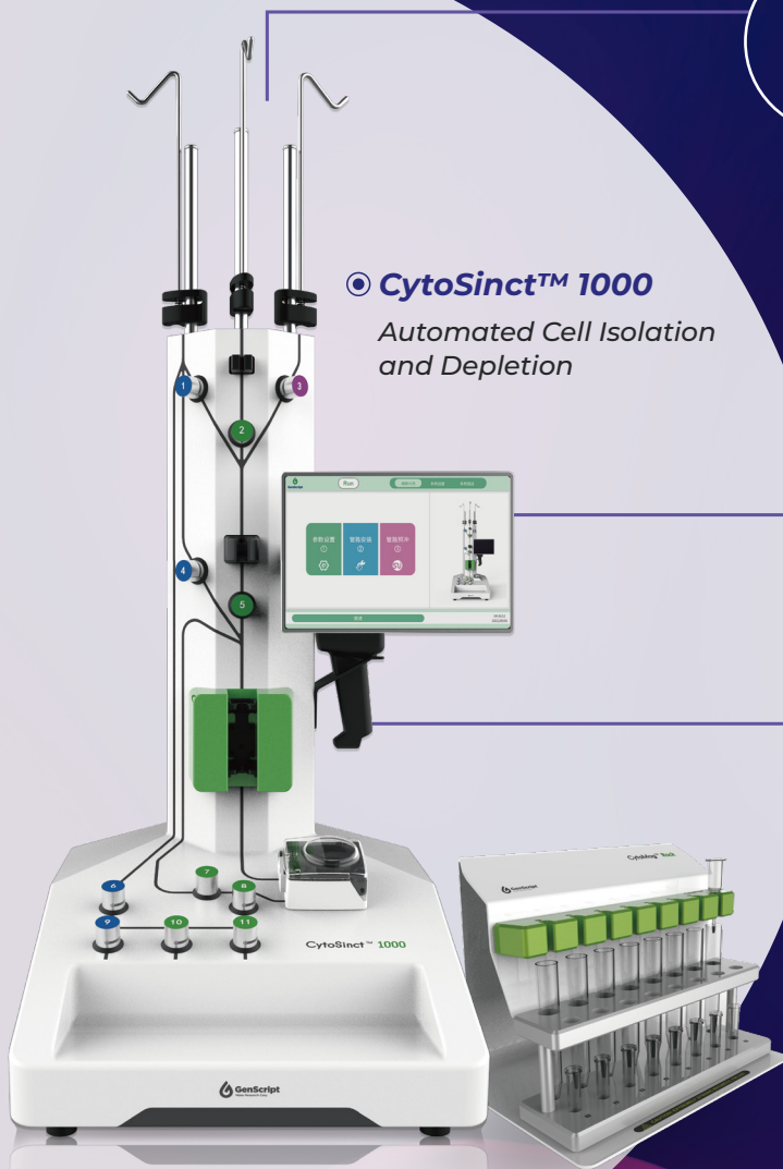
◎ CytoSinct™ 1000 Automated Cell Isolation and Depletion