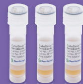
◎ CytoSinct™ Manual System